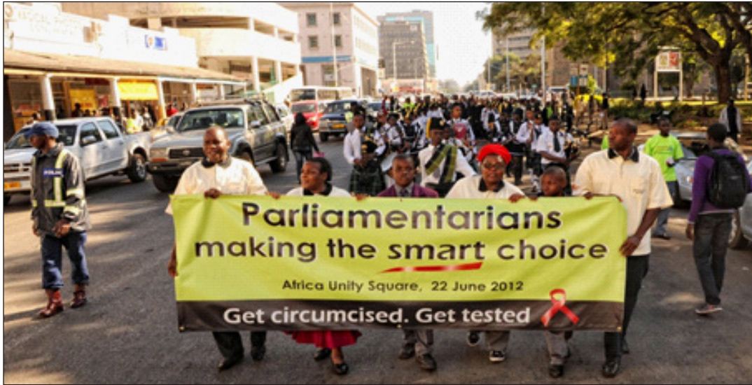
March in support of Members of Parliament making the choice to undergo VMMC