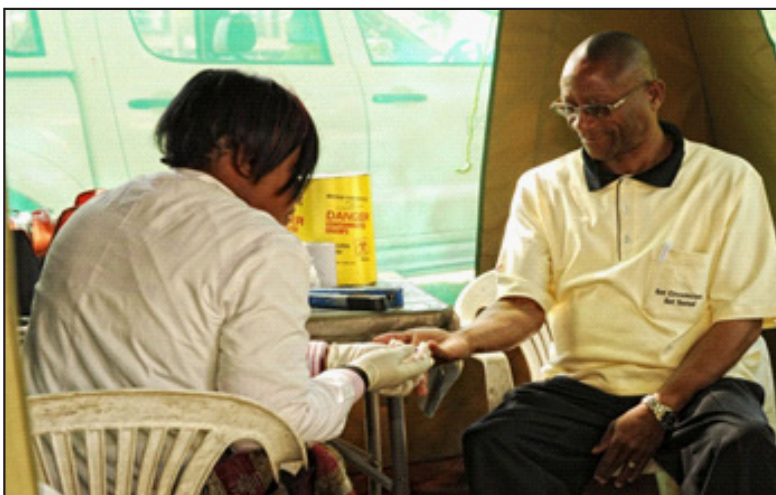
VMMC client undergoing HIV testing and counseling

Among VMMC service recipients, acceptance of HTC ranged from 75% in South Africa to 100% in Zambia, with 8 countries reporting acceptance rates of above 90% (Ethiopia, Lesotho, Malawi, Mozambique, Swaziland, Tanzania, Zambia, Zimbabwe). The proportion of individuals receiving HTC through VMMC services who tested HIV-positive ranged from 0.4% in Ethiopia to 5% in Lesotho.