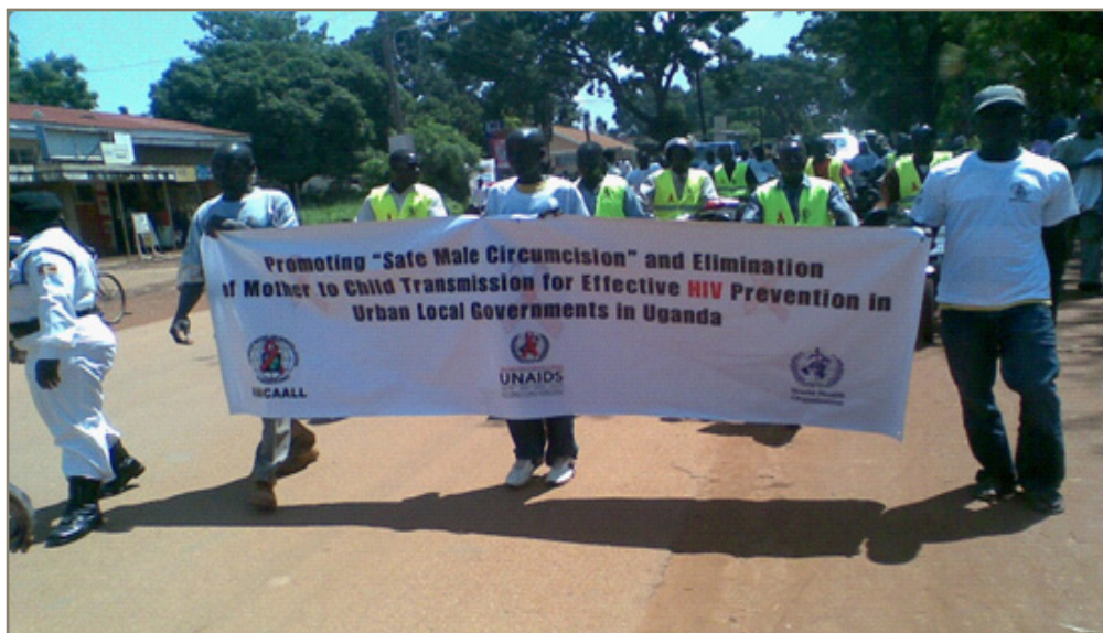
Community mobilization for Safe Male Circumcision by a Civil Society Organization (CSO)

Eleven countries (all except Lesotho, Namibia and Tanzania) reported varying approaches for involving grassroots organizations and networks in VMMC scale-up. These included information dissemination; involvement of community leaders and religious leaders; training and sensitization; and use of community mobilizers, existing community structures, health workers, schools, community outreach teams, various district and village committees and community-based organizations (Table 10).