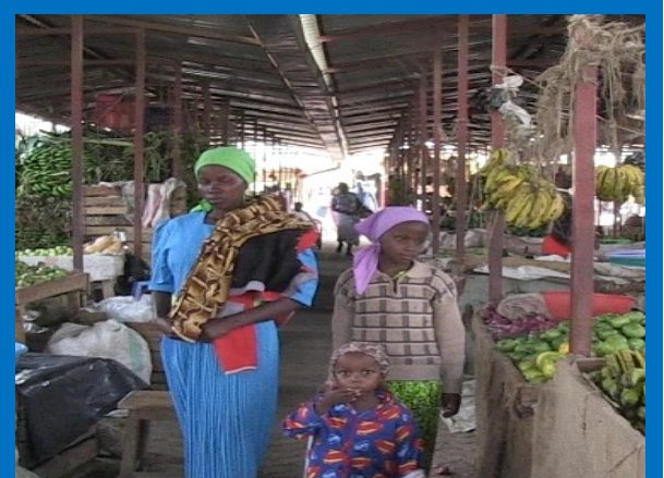
Mother & children in Food market

In the African region, women and girls are mostly found in the informal food sector and in practice are always the largest producers and distributors of fresh, processed and ready-to-eat food products including street vended foods for direct consumption. The key problems facing the informal sector of the food industry are a lack of appropriate guidance and support; a lack of easy to inspect risk-based procedures; and some gaps in educational and training support. Also, home cooks wishing to enter business from the informal sector, who are primarily women and girls, need particular guidance and support.