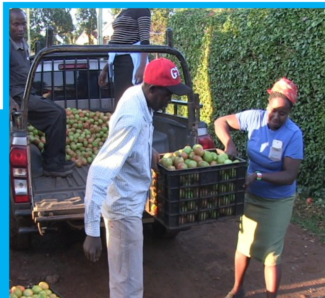
Woman in transportation practices