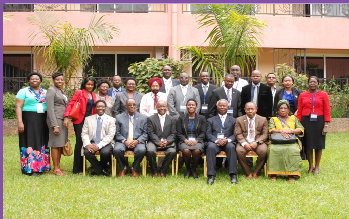
Experts from WHO, FAO, Codex Alimentarius Commission, CCAFRICA, Universities and other Research Institutions that finalized SFFA in Entebbe, Uganda

SFFA acknowledges that a key way of achieving food safety outcomes is the provision of educational materials in forms that are easy to recognise, read, understand and which are easily used by relevant stakeholders such as regulators, inspectors, business owners and consumers.