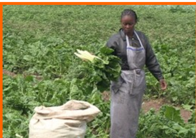
Woman harvesting spinach

The food supply chain, and hence the food value chain is composed of a diverse range of players ranging from primary food producers, processors, manufacturers and retailers.