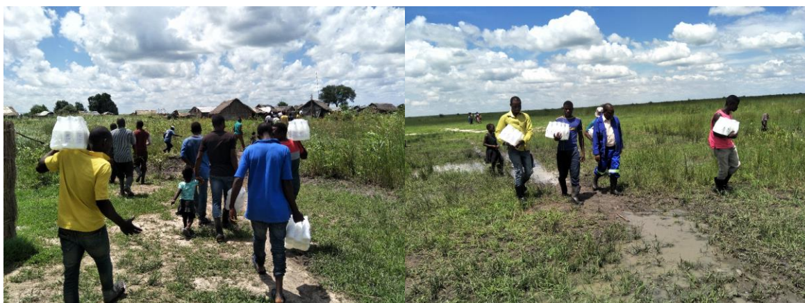
Figure2:Chlorine distribution in Shibuyunji