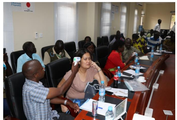
Practical session on primary screening.