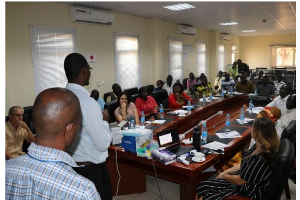
Port of entry personnel being trained on the basics of secondary screening.