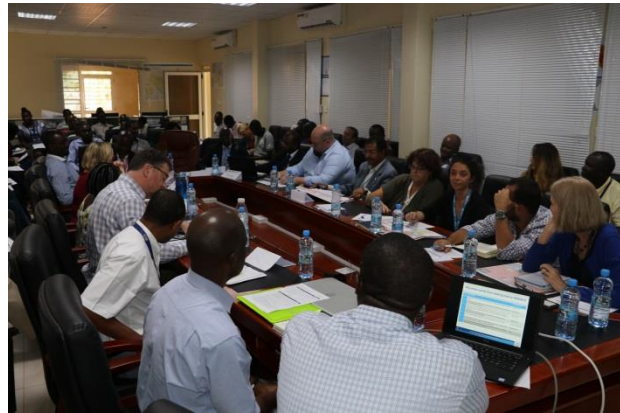
The weekly National Task force Meeting on EVD at the PHEOC.