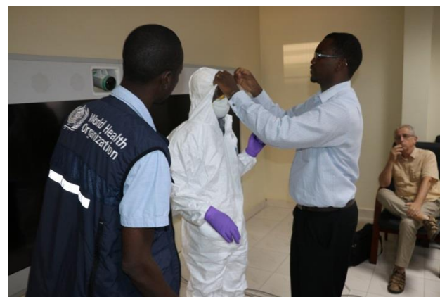
Practical training on donning and doffing of PPEs.