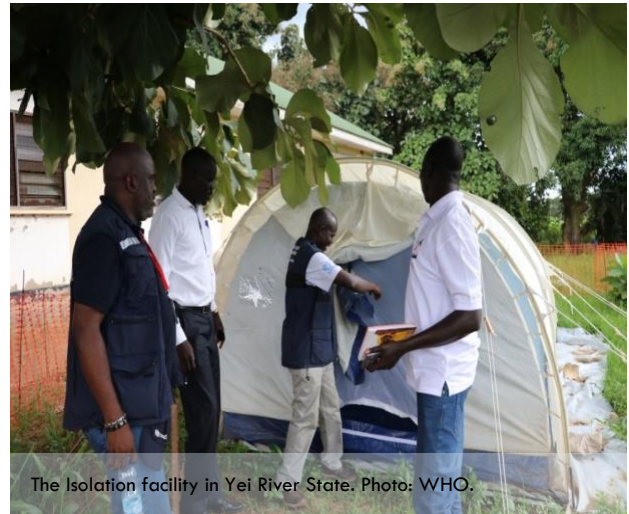
The Isolation facility in Yei River State.