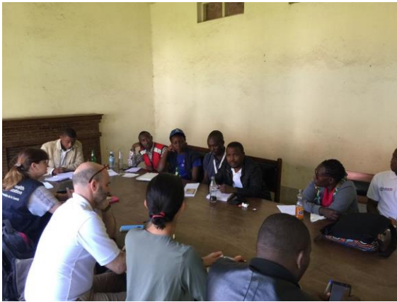
Fig 3 – Kabarole DTF 19 th September 2018 (Left)