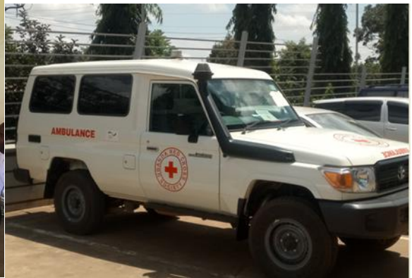
Fig 4 – Ambulance stationed at EOC, supported by WFP and URCS (Right)