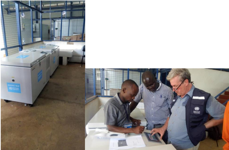
Fig 1 &2 – Left; Installation of Cold-chain for Ebola Vaccine in Entebbe at NMS. Right – WHO and MOH staff configuring the temperature reading on the cold chain freezers