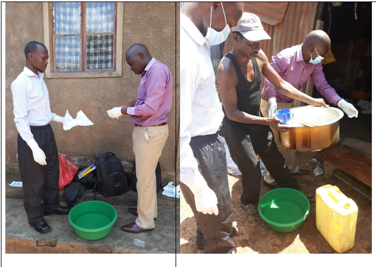
Makindye Division Team at the scene of the community death at Katwe II Musoke Zone