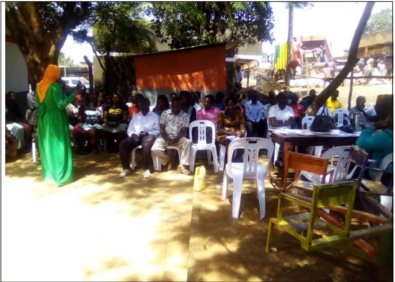
Bazara held at Nsambya Ave Maria, Makindye Division