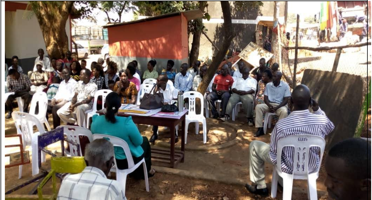
Community Dialogue meeting at Kisenyi Musajalumba, Central Division