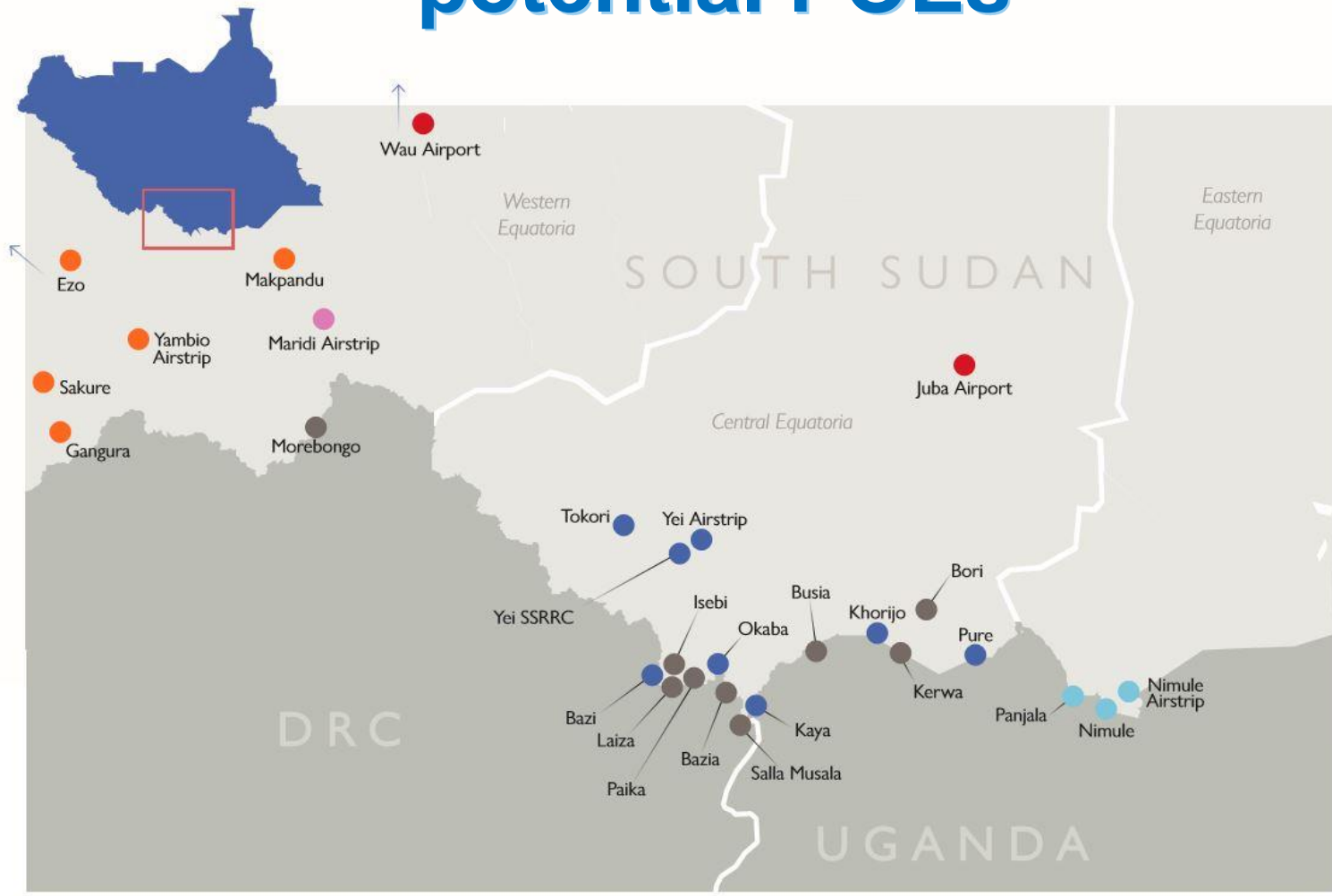
POINTS OF ENTRY: OPERATIONAL & UPCOMING