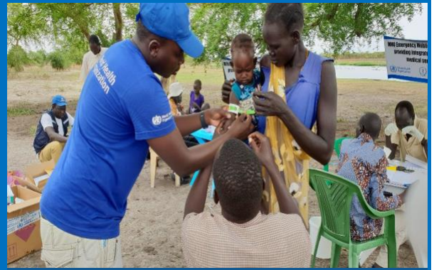
Emergency Mobile medical Team (EMMT) assessing the nutritional status of a child as part of the integrated health services provided to returnees in Old Fangak.