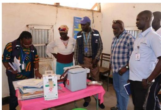
WHO Country Representative visiting a health facility.