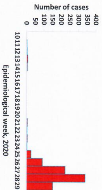
Figure 1: Epi-Curve for confirmed COVID-19 cases, 13 July

Namibia has recorded a total of 864 COVID-19 cases since 13 March 2020. Up to 339 (39.2%) of the total cases were recorded during week 28 (Figure 1).