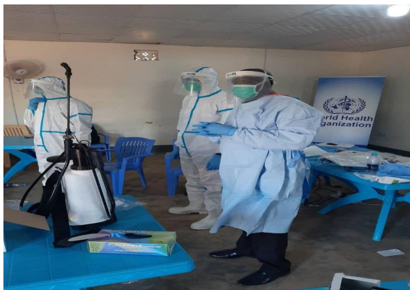
WHO and partners in Kuajok supporting the State Ministry of health to conduct a training for rapid response teams and contact tracers, 29-30 June 2020