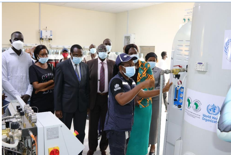
African Development Bank and WHO installed Oxygen generation Plant at Juba Teaching Hospital.