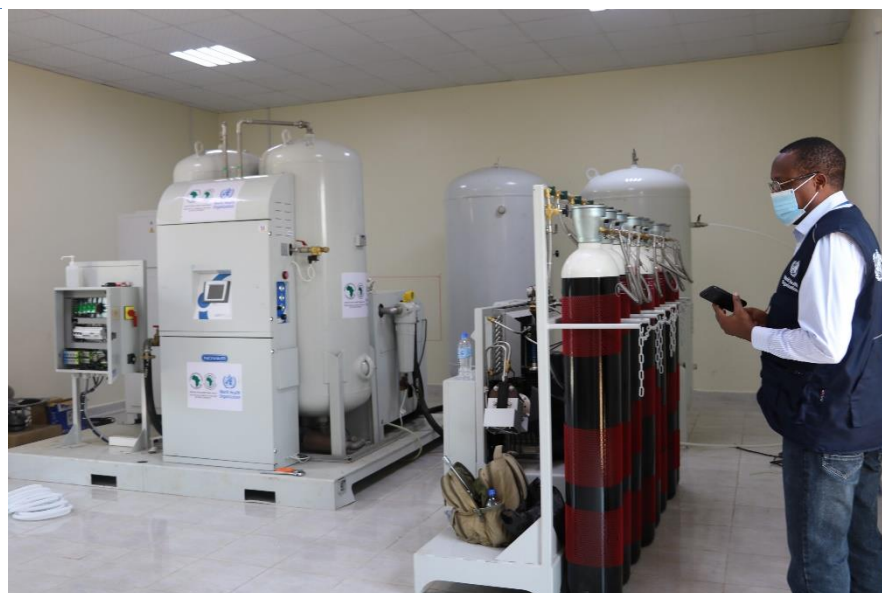
South Sudan has begun producing oxygen following the successful installation of the country's first oxygen plant in Juba, set up with funding from the African Development Fund through WHO to support COVID-19 response.