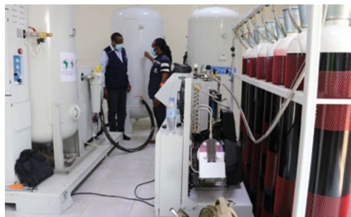
WHO supported the Ministry of Health to establish the first oxygen plant in Juba, procured with funding from Africa Development Bank as part of measures to support the ongoing #COVID19 response