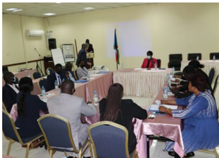
WHO supported the Ministry of Health to convene 1st meeting of the Health Sector Ministerial Advisory Board as a mechanism for overall sector stewardship & policy coherence in Juba. The Conference was attended by State Ministers of Health.

In 2021, 26 national-level health cluster coordination meetings were held, and 11 field monitoring visits were conducted in 10 counties.