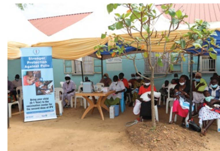
South Sudan launched introduction of a nationwide 2 dose of routine inactivated Polio vaccine aims to vaccinate over 592 000 infants against all 3 types of poliovirus, including wild poliovirus and vaccine derived

Further, the pandemic has exposed its impact on mental health and together with partners. WHO is mainstreaming the mental health needs into healthcare provision. Partners' financial support has helped ramp up COVID-19 care, reduce violence in the community, and meet some of the current demands of the country.