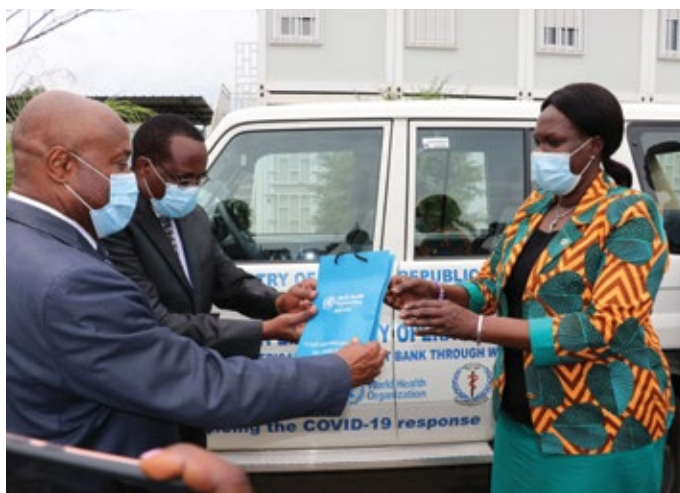
Honorable Elizabeth Achuei Yol, Minister of Health received the first shot of #COVID19 vaccine alongside eligible high-level government officials at Juba Teaching Hospital during the launch of the vaccine rollout in South Sudan in April 2021