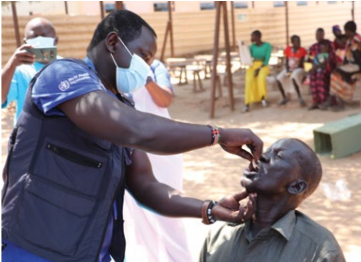
A client receives oral cholera vaccine in Bentiu IDP camp during the Oral Cholera Vaccination campaign in January 2022