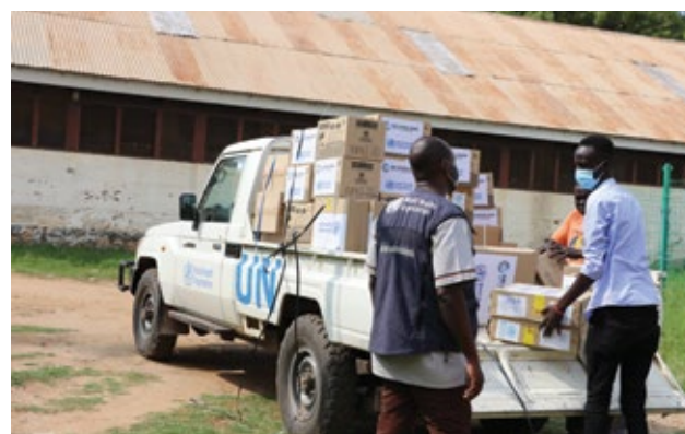
WHO prepositioned essential drugs to Juba Teaching Hospital to support delivery of healthcare services