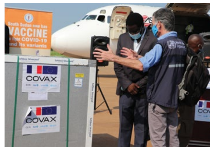
South Sudan receives additional doses of COVID-19 vaccines via COVAX facility