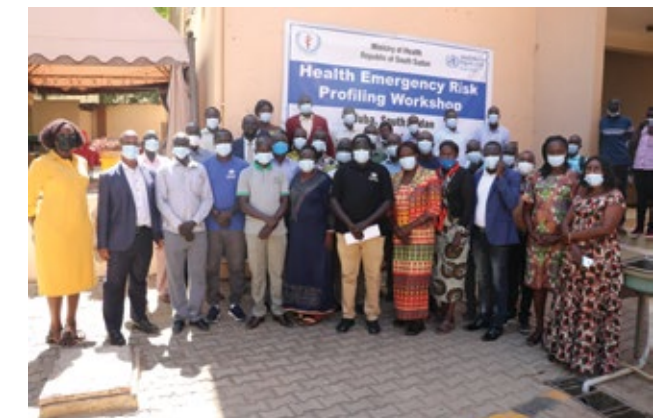
WHO supported the Ministry of Health to conduct the health emergency risk profiling to inform prioritization of hazards for preparedness and contingency planning to prevent, mitigate and improve emergency

Despite efforts, communicable disease tracking and access to basic health services, including mental health, remain a challenge. Combined with limited resources and human capital, the country is trying to overcome these challenges with support from development partners.