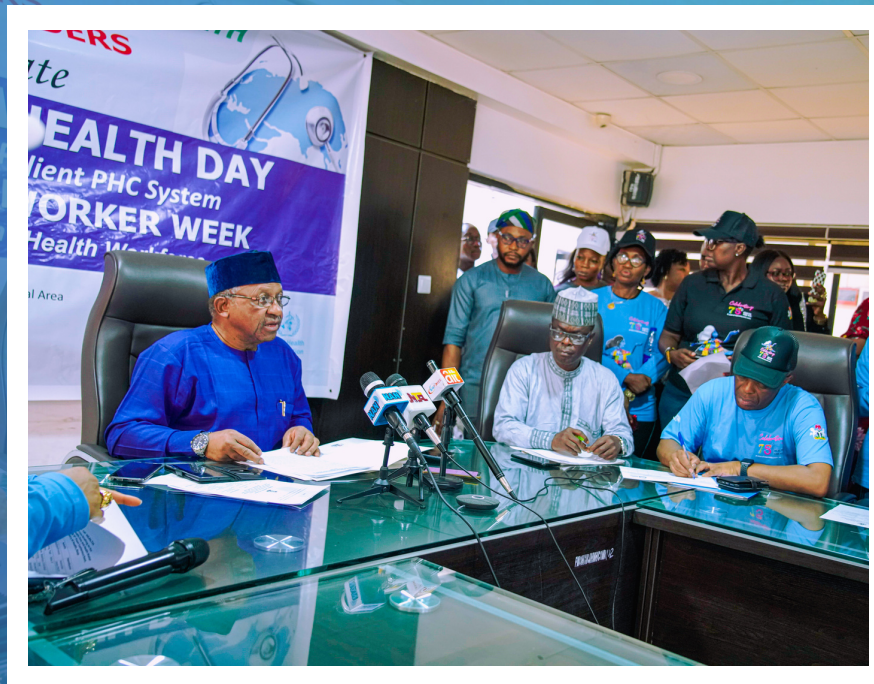
Press conference to mark world Health Day and WHO 75 anniversary

"I want to congratulate the WHO on this 75th anniversary of active service to humanity and thank the WHO for supporting the entire health sector in Nigeria technically and financially these years".