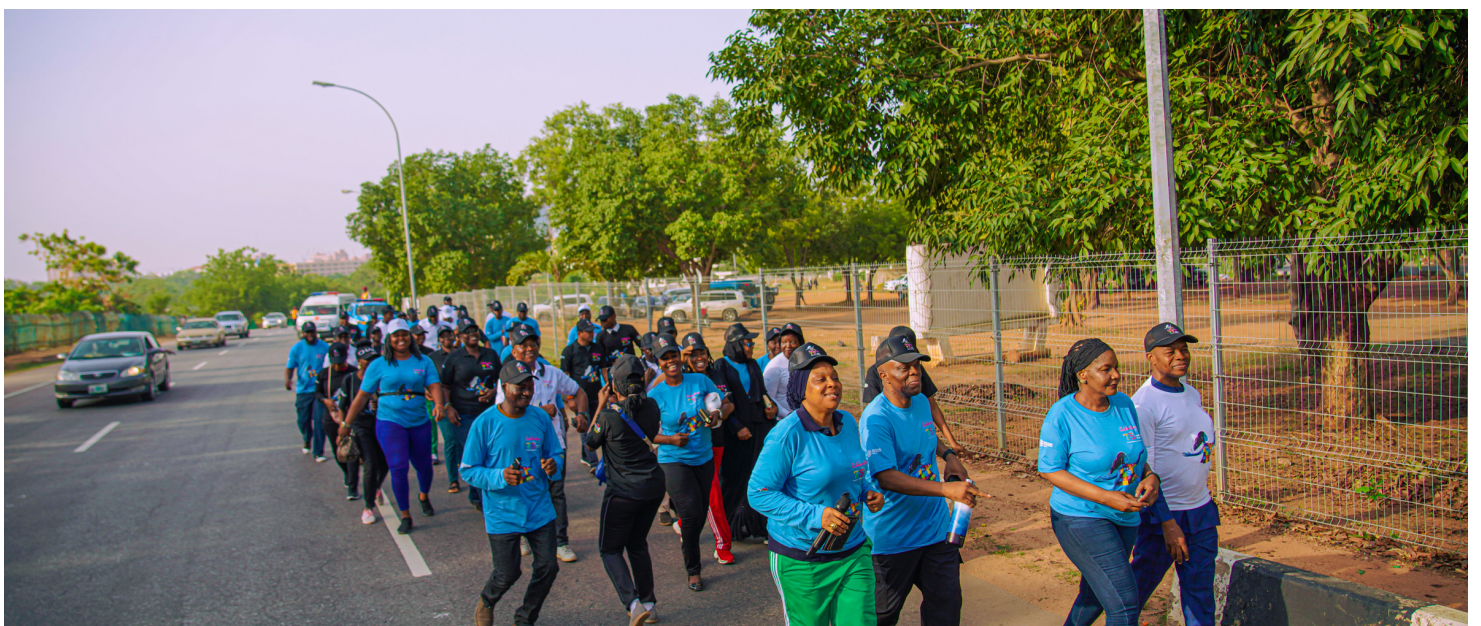
Walk the Talk to mark 2023 World Health Day