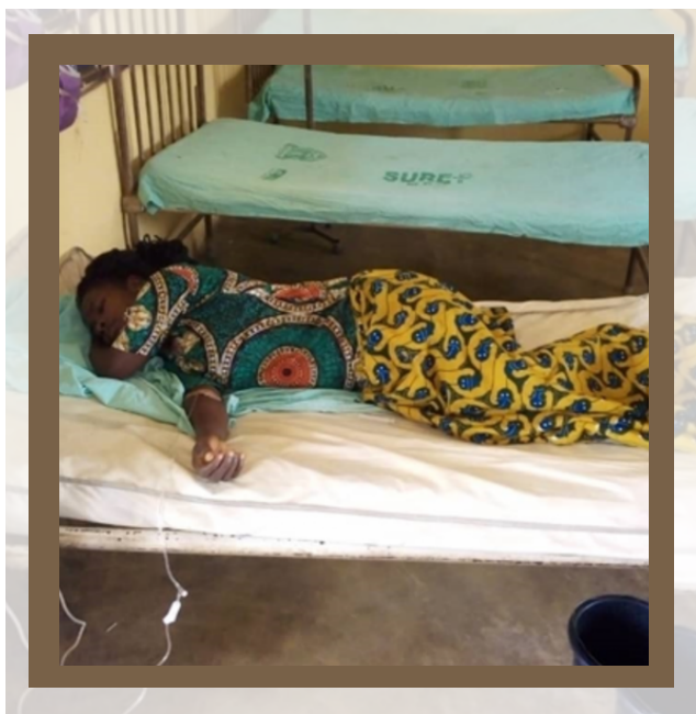
1A patient on IV fluids at Ofatura PHC, Obubra LGA

Cholera is endemic in Nigeria. It is highly contagious and occurs in places without safe water and proper sanitation. It causes profuse diarrhoea and vomiting, and without treatment can quickly lead to severe dehydration followed by death.