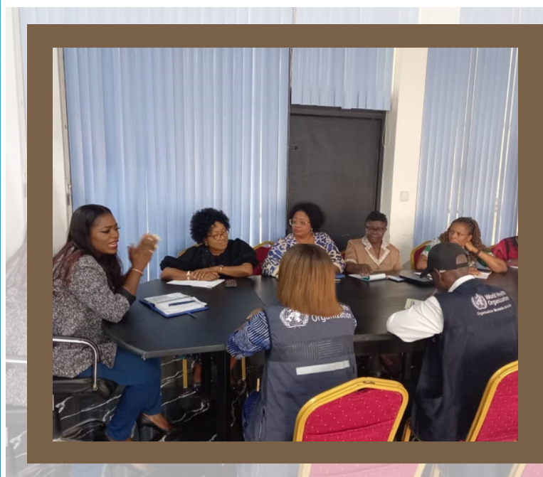
Coordination meeting with the Commissioner of health and key stakeholders

An epidemiological report from the State Ministry of Health shows that 638 suspected cases and 17 deaths have been reported between December 2022 and February 2023 in the affected LGAs.