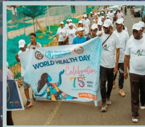
WHO 75 anniversary commemoration Walk the Talk in Osogbo, Osun State