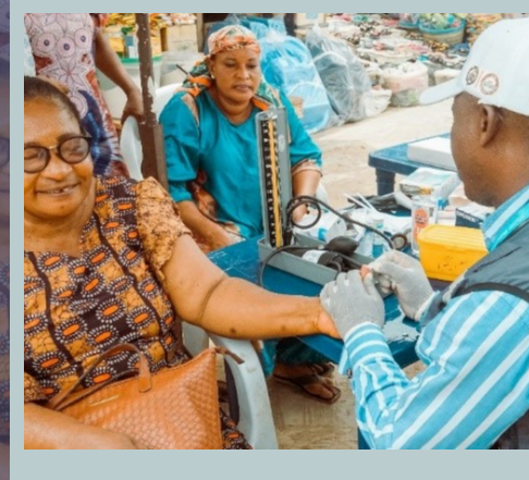
A beneficiary of the WHO 75 free medical outreach in Osogbo, Osun state