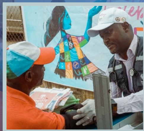
A staff checking blood pressure of a beneficiary at the WHO at 75 free medical outreach in Osogbo