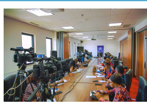
World Malaria Day and African Vaccination Week Press briefing