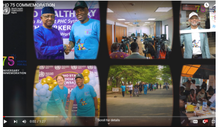
WHO Nigeria 75th Anniversary Commemoration