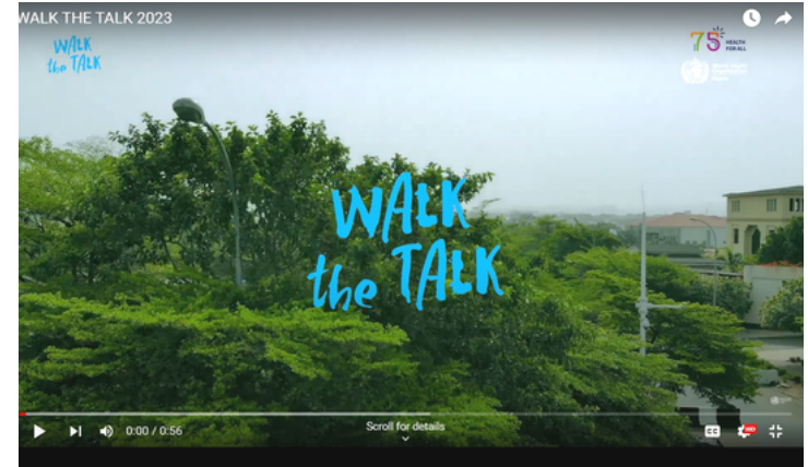
WALK THE TALK