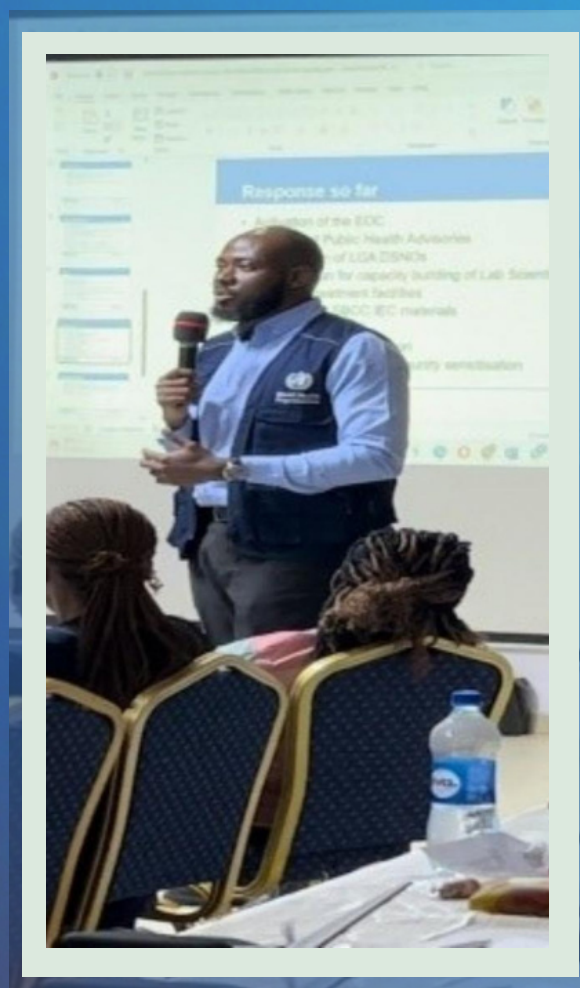
FA training session for health workers in Lagos State

Nigeria began reporting the Diphtheria outbreak in May 2022. From then till March 2023, 389 confirmed cases have been reported in 6 states across the country.