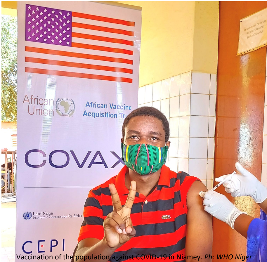
Vaccination of the population against COVID-19 in Niamey.

of polio cases were detected within 7 days of the paralysis onset in 2022