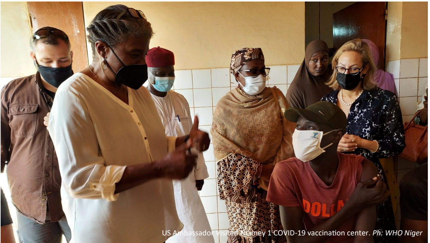
US Ambassador Visited Niamey 1 COVID-19 vaccination center.

In contrast, the epidemiological situation of polio is characterized by the persistence of circulating cases of poliovirus derived from the vaccine type 2 strain (cVDPV2). From January 2022 to April 2023, 32 cVDPV2 cases from acute flaccid paralysis (AFP) and environmental surveillance were recorded. Niger was classified as a cVDPV2-infected country with evidence of local transmission and risk of international spread.