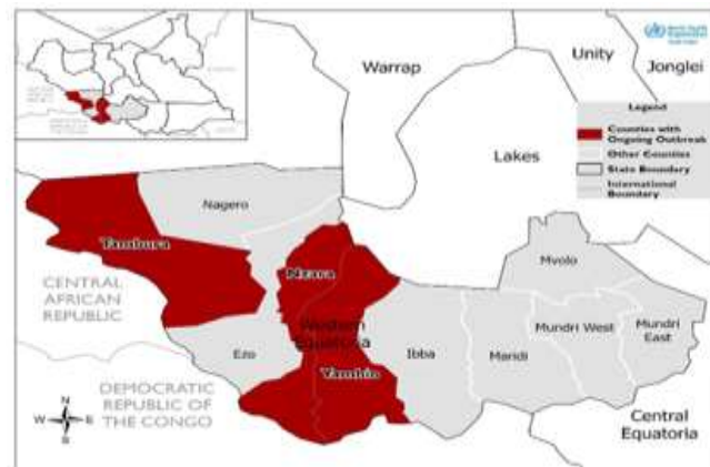
Map 1: Location of Suspected Viral Haemorrhagic Fever