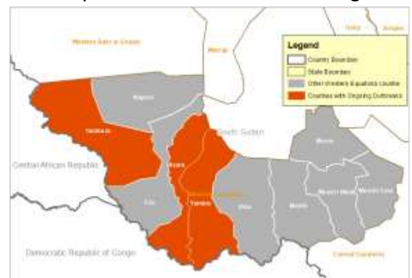
Map 1. Location of Yellow fever outbreak in South Sudan