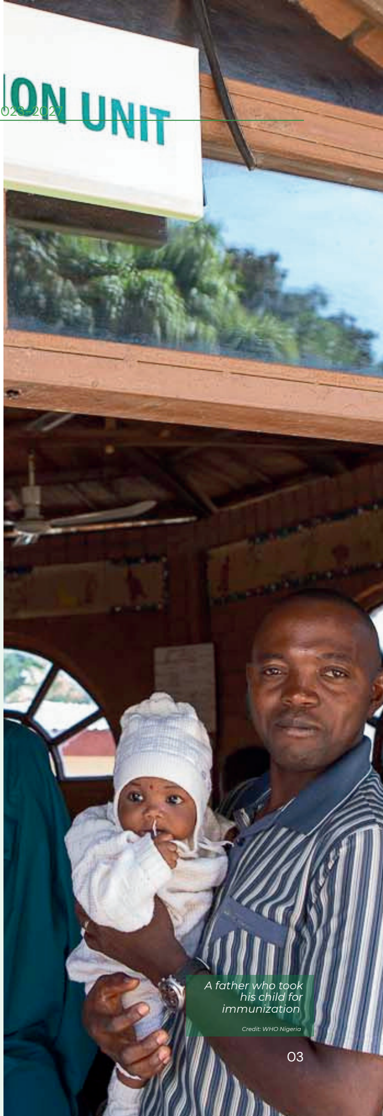
A father who took his child for immunization

Some key health challenges in the country include limited access to quality, integrated health services resulting in high preventable morbidity and mortality. Out of pocket expenditure remains very high while weak governance and accountability mechanisms undermine effective implementation of health policies and programs. Limited intra- and inter-sectoral collaboration for health at all levels has impeded accelerated progress towards the health-related SDGs.