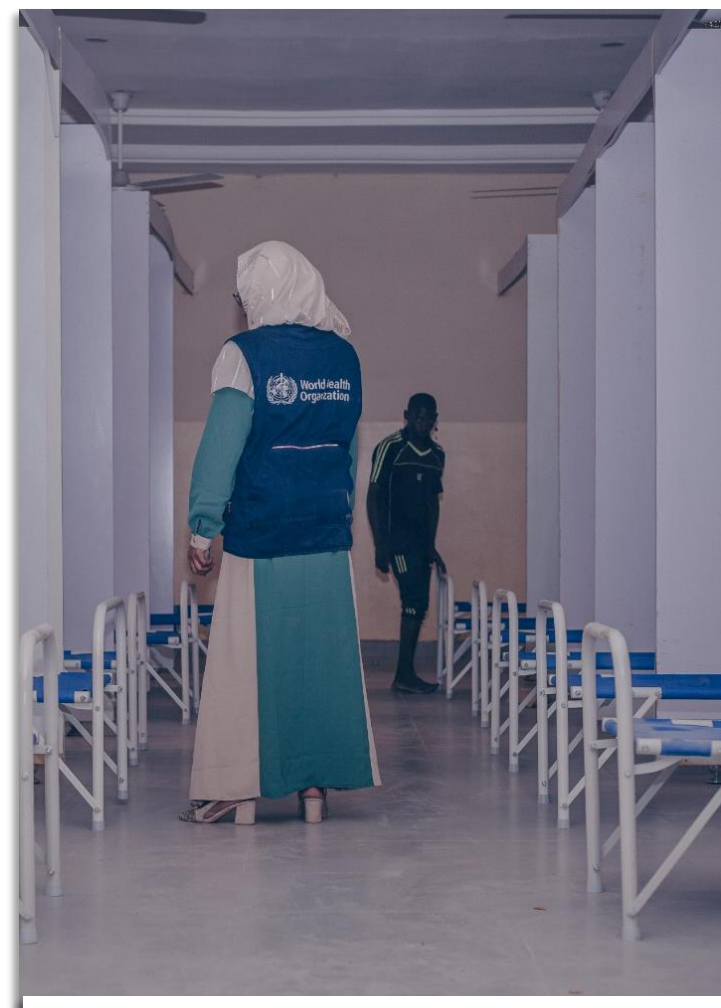
Inspecting one of the cholera treatment centres in the country.

Of the 34 states plus the Federal Capital Territory (FCT), that have reported at least a single case from week 1 to 27, seven (7) states plus the FCT reported 201 suspected cases, with seven deaths and case fatality ratio of 3.5% in week 28 alone, putting more pressure on the treatment centres. Nevertheless, WHO across the states has coordinated partners to both expand and set-up new treatment centres to ensure quality of care is provided to the vulnerable persons in the high-risk locations. In addition, WHO has provided on-the-job mentoring to at least 210 healthcare workers across the treatment centres and health facilities on effective management of cases and adhering to treatment guidelines. The infection, prevention and control aspect of the response is another critical area WHO is guiding the Government. This is geared toward following the appropriate IPC measures, to mitigate the risk of spread, especially among health workers. WHO also provided at least 1000 IPC medical commodities, such as facemasks, hand gloves, hand sanitizer, etc.