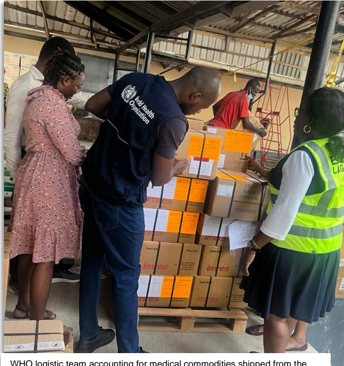
WHO logistic team accounting for medical commodities shipped from the national to the state.

Operations support is a critical area the World Health Organization (WHO) is maximally utilizing, to ensure seamless, timely, and efficient support is provided to the states through the Federal Government. This includes the donation of medical consumables and deployment of national rapid response teams to the hotspot's states. Currently, WHO has supported the deployment of 12 response teams to support key thematic areas such as case management, and health information management (HIM)/surveillance). In addition, WHO has donated medical items to states such as Lagos state. At least 35 essential emergency community and periphery cholera kits were donated to the state. These kits have the capability of treating more than 5,000 vulnerable people who are affected by the outbreak. Finally, the logistics from the ward level, up to the state and national is being strengthened to ensure overall efficiency, especially the transportation of cholera samples.