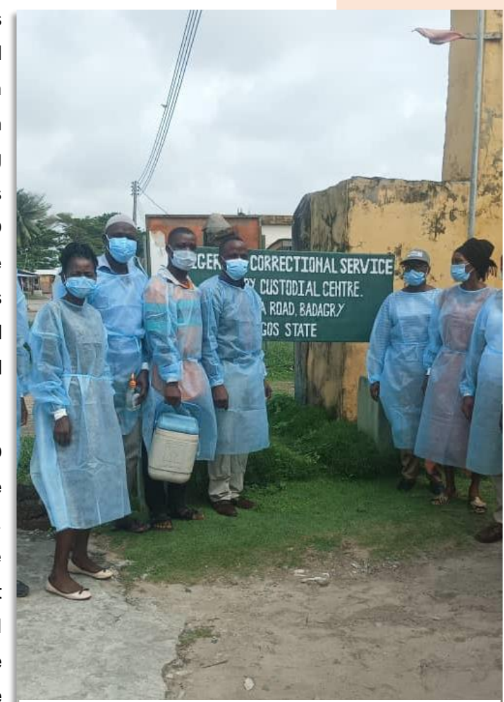
Community teams at one of the correctional centres in the country after collecting samples of cholera.

With at least 22 samples that are yet to be tested, WHO is constantly following up with the National Reference Laboratory (NRL) to ensure the testing is expedited. This will help in improving the quality of the response across the country. Worthy of note, this strategic support from the national, to the state, and the local governments, is not only geared toward refining the overall processes of sample collection, but to boost the turn-around-time (TAT) of the results tested.