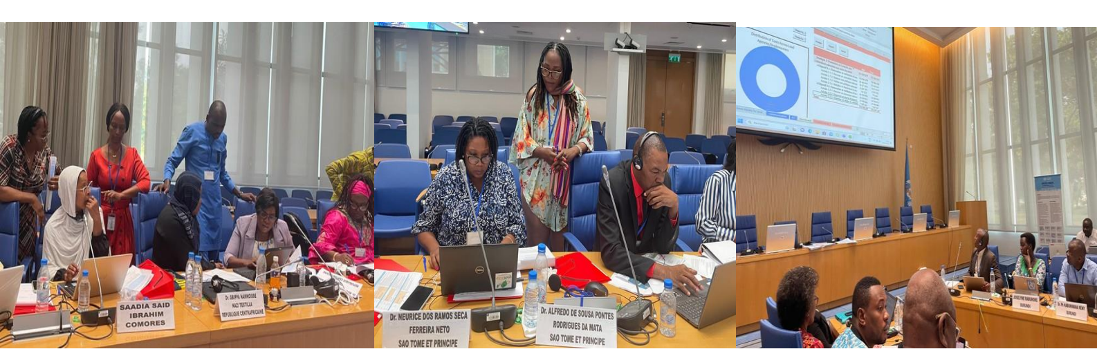
Phase II: Participants interacting with Regional TOTs and presenting their practice exercise during the multi-country training, 5-7 July 2023

A primary goal of the training of the six countries was to equip participants with the necessary knowledge and skills to utilize the Tool for their respective AMR NAPs, which was successfully accomplished. In addition to practical exercises within each module, the final day of the training featured a simulation exercise. During this exercise, participants utilized the Tool to cost their drafted operational plans and subsequently presented their work during the plenary session. At the conclusion of each training day, a debriefing session took place between the Regional TOTs and Master Trainers. These sessions aimed to identify areas for improvement and implement corrective actions to ensure the objectives of the training and workshop were met. After the conclusion of the multi-country training, participants began planning concrete steps towards the final phase, namely, the costing workshop. They engaged in activities such as collecting and reviewing necessary information for the costing of their plans (e.g., unit costs, exchange rates), assessing the proposed activities in their operational plans, and reaching out to colleagues for additional information and collaboration. Additionally, participants completed Training Evaluation Forms and were awarded WHO certificates for their participation in the training.