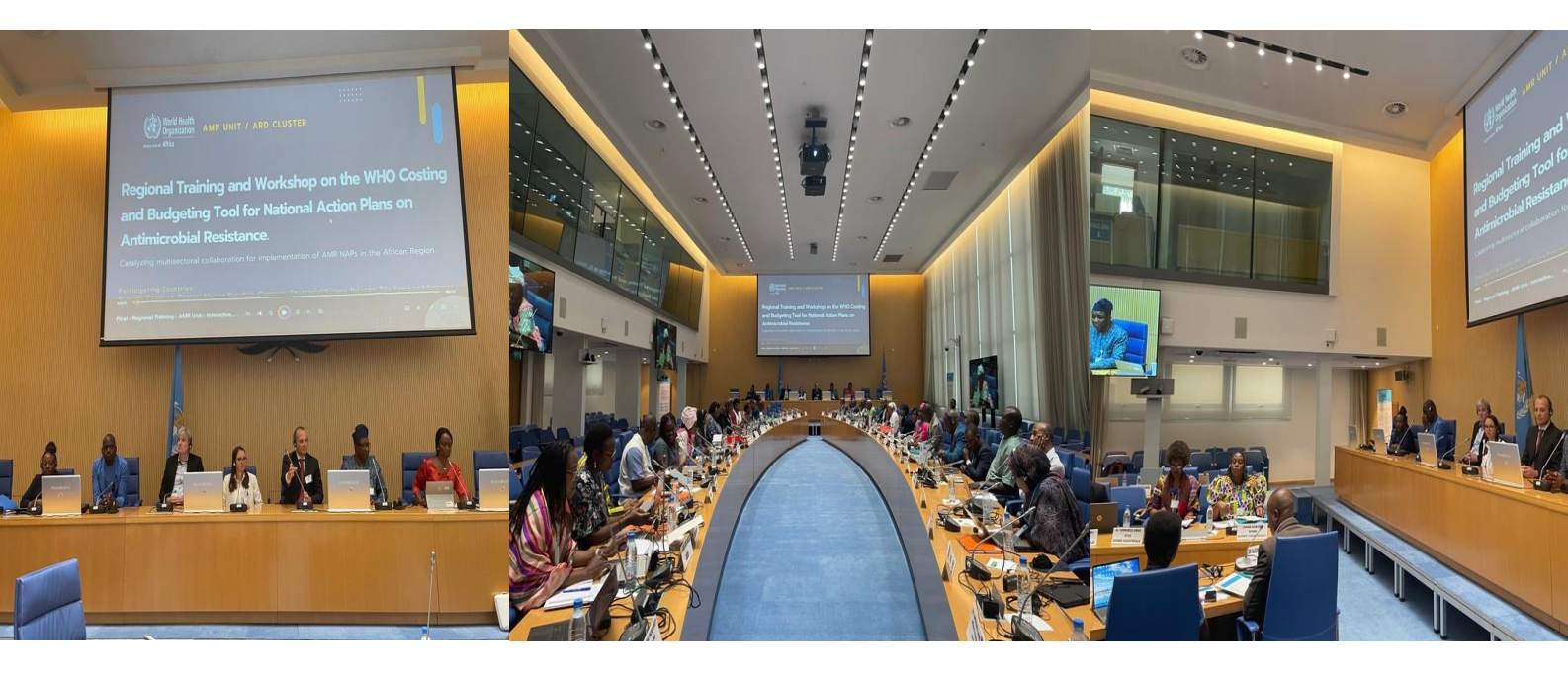
Opening ceremony for Phase II multi-country training, 5-7 July 2023