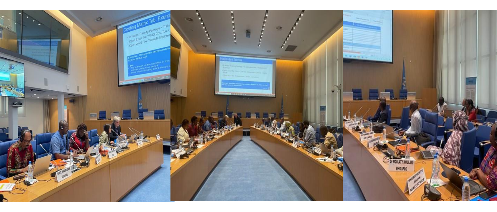
Phase I: Refresher training for the Regional TOTs led by the Master Trainers, 3-4 July 2023