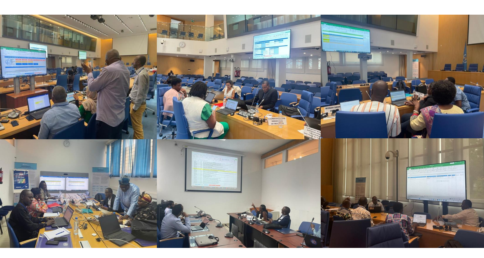
Phase III: Costing of plans. From top left to bottom right is Comoros, Sao Tome and Principe, Equatorial Guinea, Central Africa Republic, Rwanda and Burundi, 10-14 July 2023

One of the primary outcomes of the workshop was the costing of prioritized activities from the AMR National Action Plans (NAPs) by the six countries, as part of the efforts aimed to bolster advocacy, resource mobilization, implementation, and monitoring initiatives.