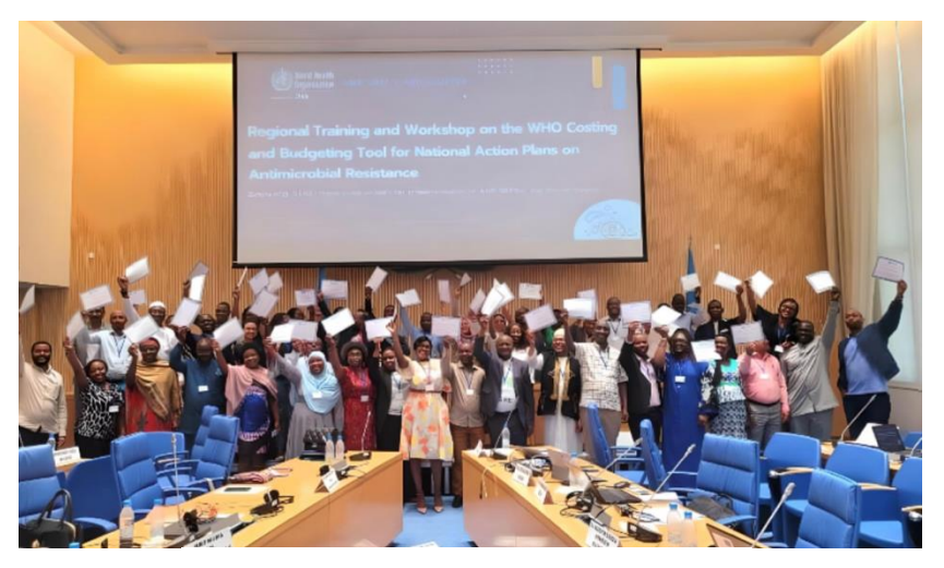
Certificate ceremony, 7 July 2023