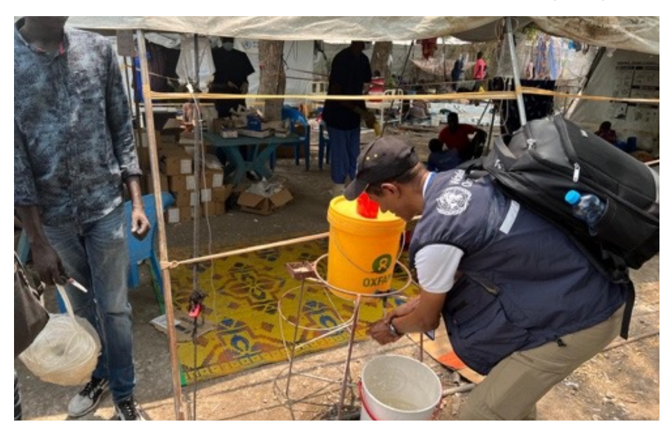
WHO deployed a team responding to the cholera outbreak in Akobo. Chorea Treatment Centre in Akobo County Hospital, Akobo County, Jonglei state, S. Sudan, on 6 March 2025

Cultural Practices: In some communities, traditional beliefs and practices may conflict with cholera prevention strategies, such as proper sanitation and seeking timely medical care.