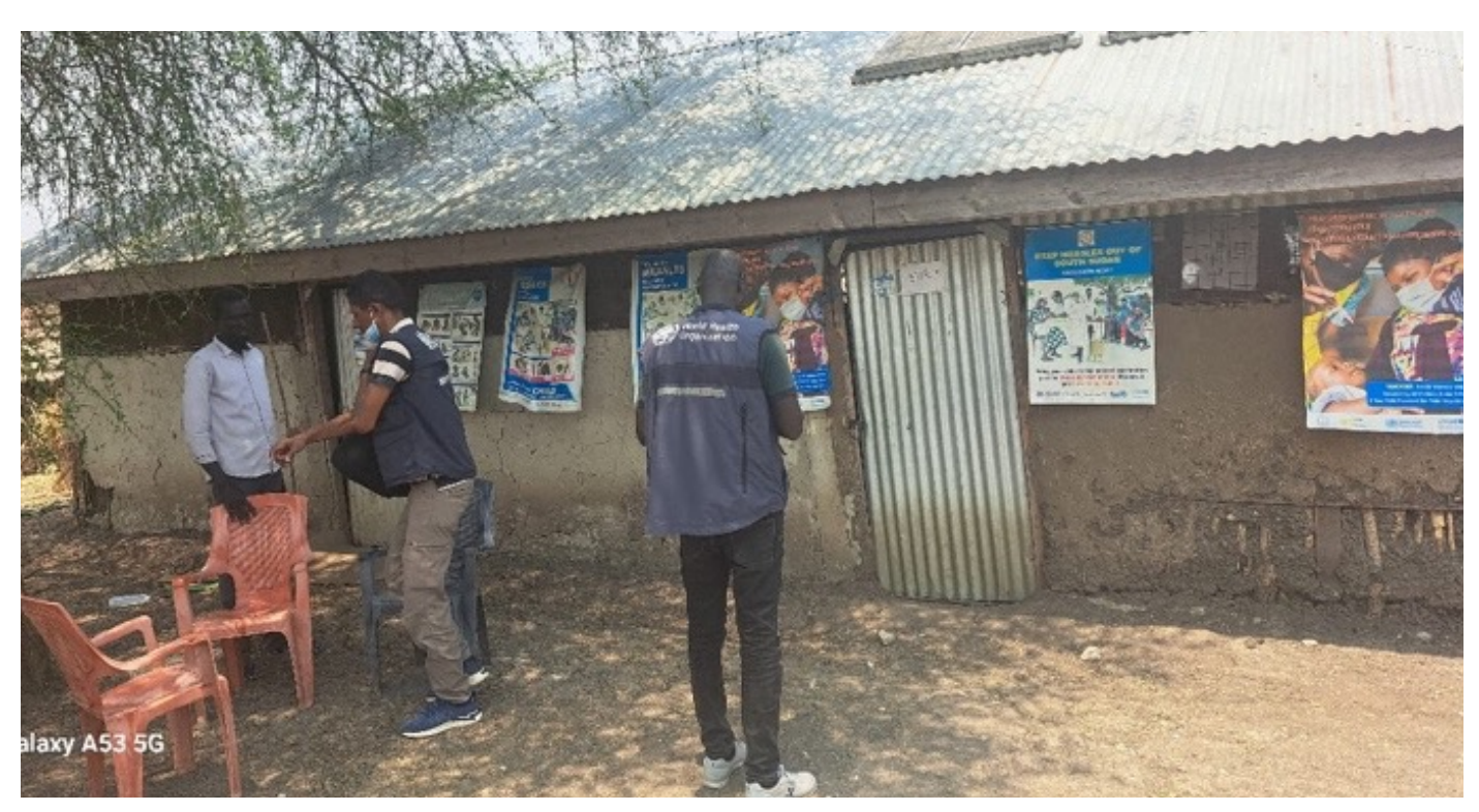
WHO providing support supervision and mentorship to healthcare workers at Dengjok & Thokliel PHCC.