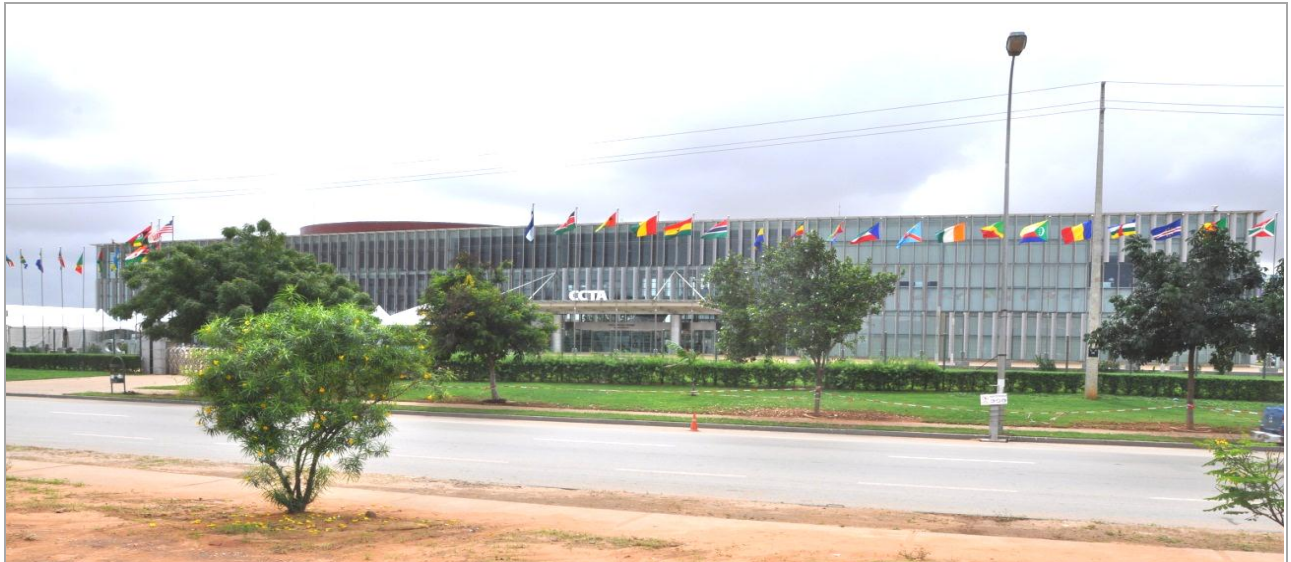
Front view of the Talatona Convention Centre, Luanda, Angola