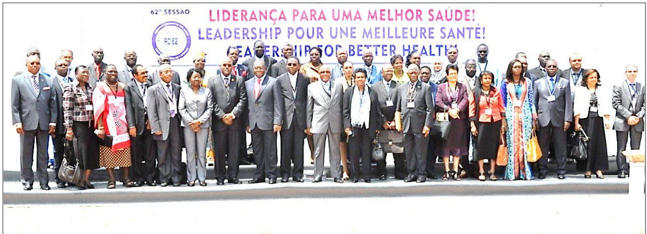
Group photograph taken shortly after the opening ceremony