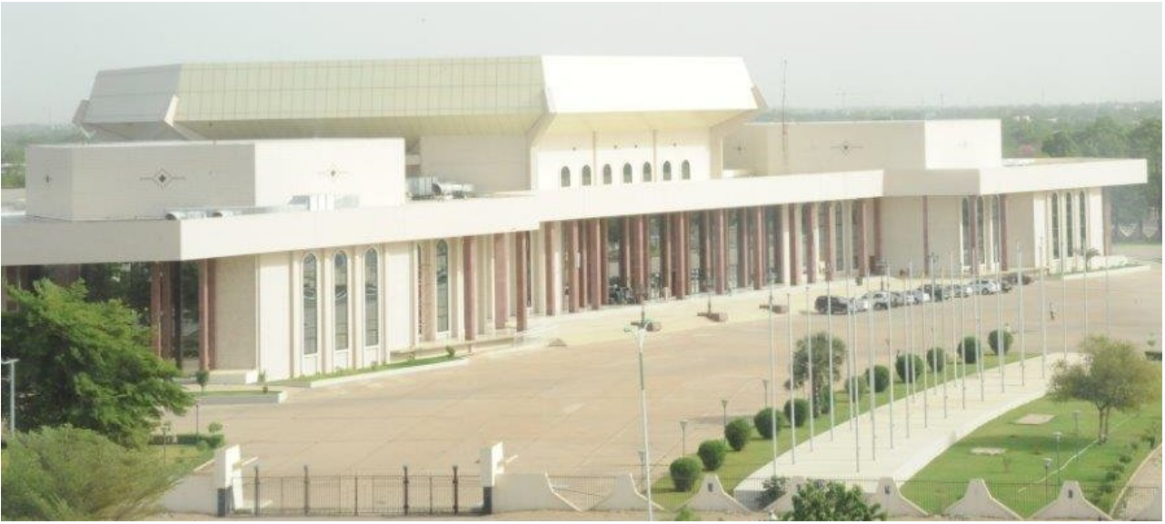
Front view of the Palais du 15 Janvier