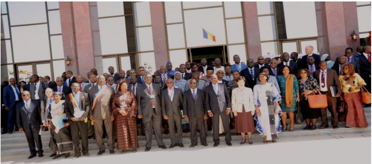
Group photograph taken shortly after the opening ceremony